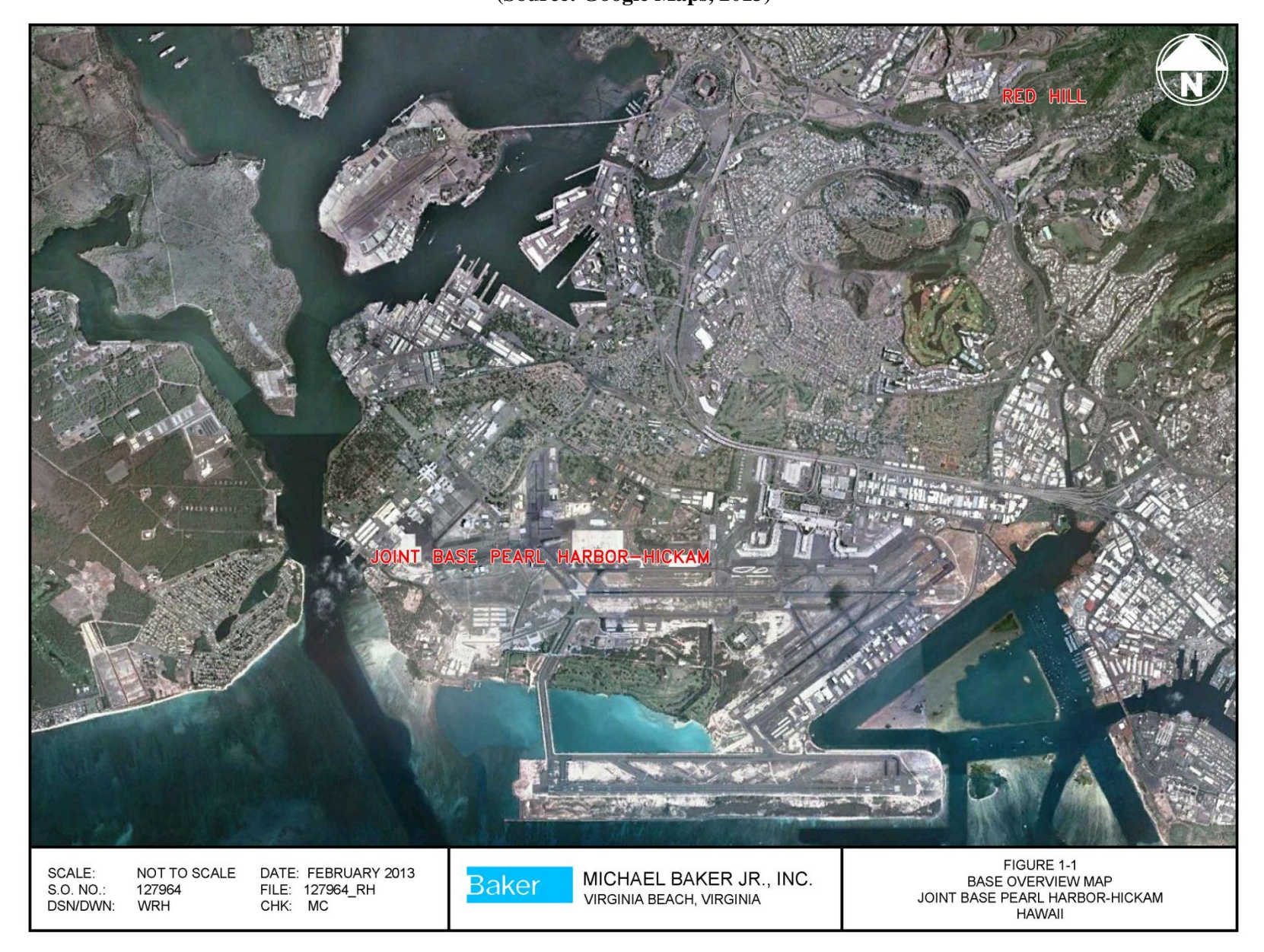
Figure 1-1: Base Overview Map