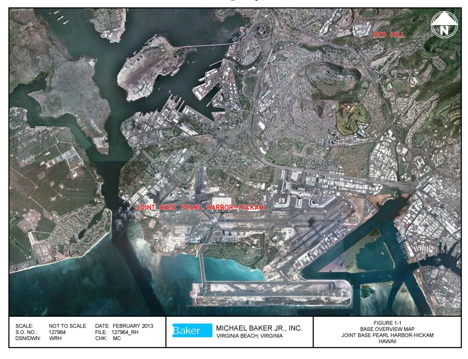
Figure 1-1: Base Overview Map