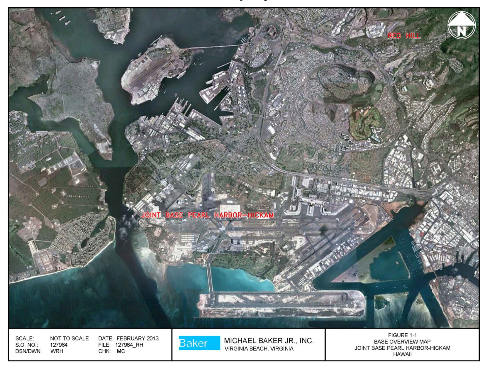
Figure 1-1: Base Overview Map