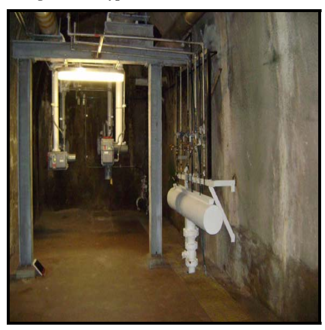
Figure 1-2: Typical Tank Bottom Access