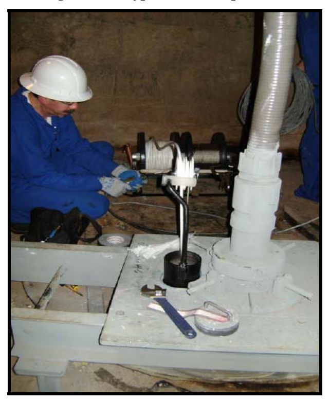
Figure 1-3: Typical Tank Top Access