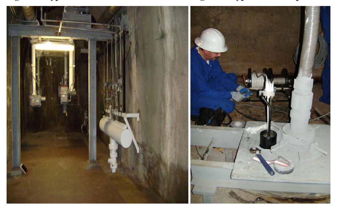
Figure 3: Typical Tank Top Access