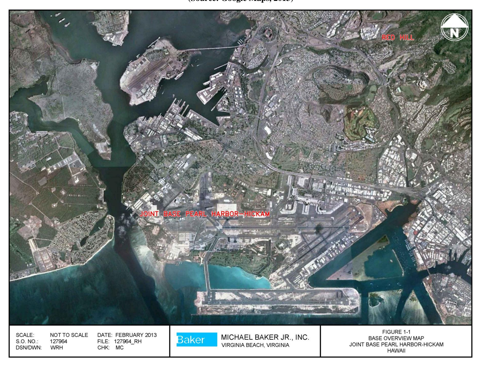
Figure 1-1: Base Overview Map