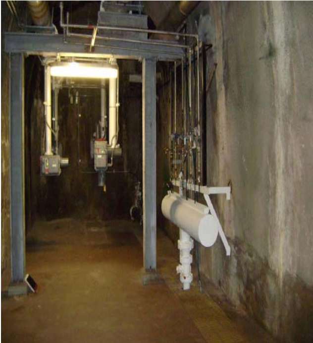
Figure 2: Typical Tank Bottom Access