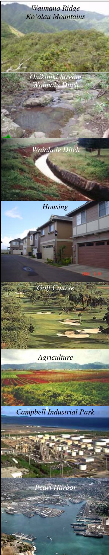
Waimano Ridge Ko'olau Mountains