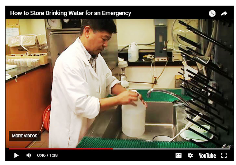
Watch this how-to video at: hbws.me/prep

To prepare the container for storing water, wash it thoroughly, then rinse it in a mild bleach solution* (one capful of liquid bleach to one gallon of water), then drain and rinse thoroughly.