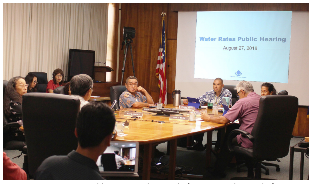
At its Aug. 27, 2018, monthly meeting, the Board of Water Supply Board of Directors voted to adopt Resolution No. 889, 2018.

rates were shared in the previous Water Matters issue. They are also posted on the BWS website at boardofwatersupply.com/waterrates.