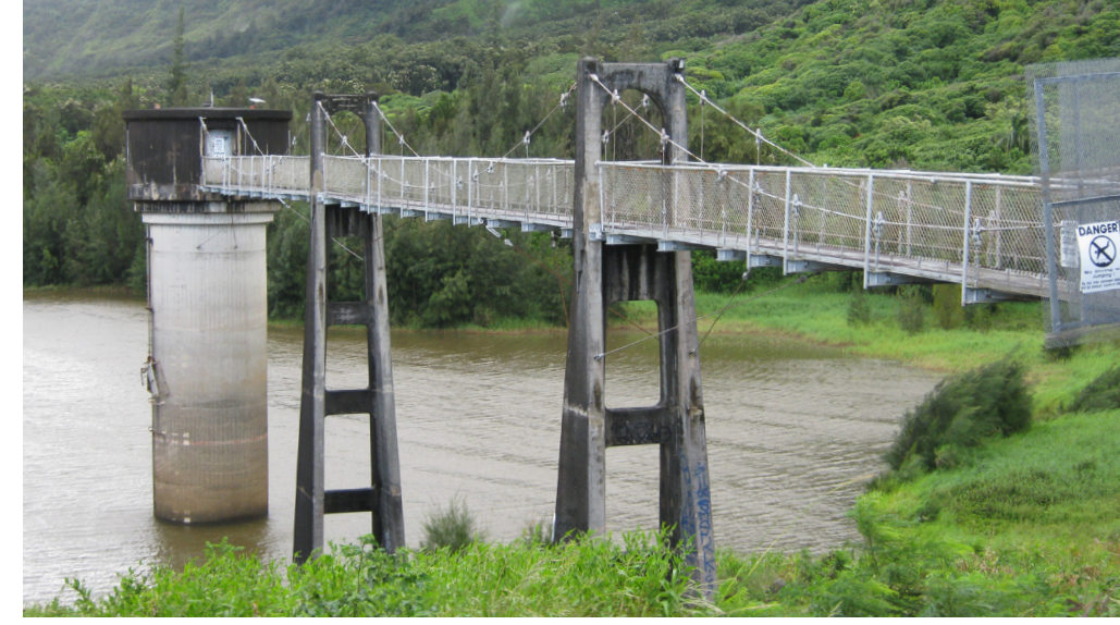
Nuuanu Reservoir No. 4 features a tower through which water drains from the reservoir pool.