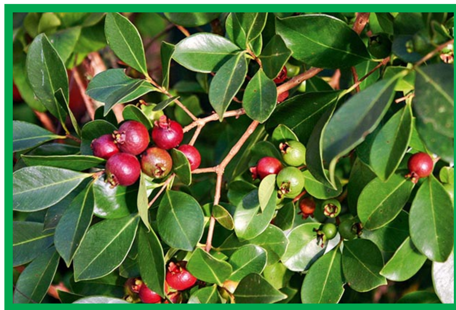
Strawberry guava ( Psidium cattleianum )

The Honolulu Board of Water Supply (BWS) Watershed Program works to ensure an adequate supply of fresh water for current and future generations, by protecting the ability of O`ahu's watersheds to capture and store rainfall in the aquifers below. This ability is critical, as rainfall is the sole natural source of fresh water supply for the island.