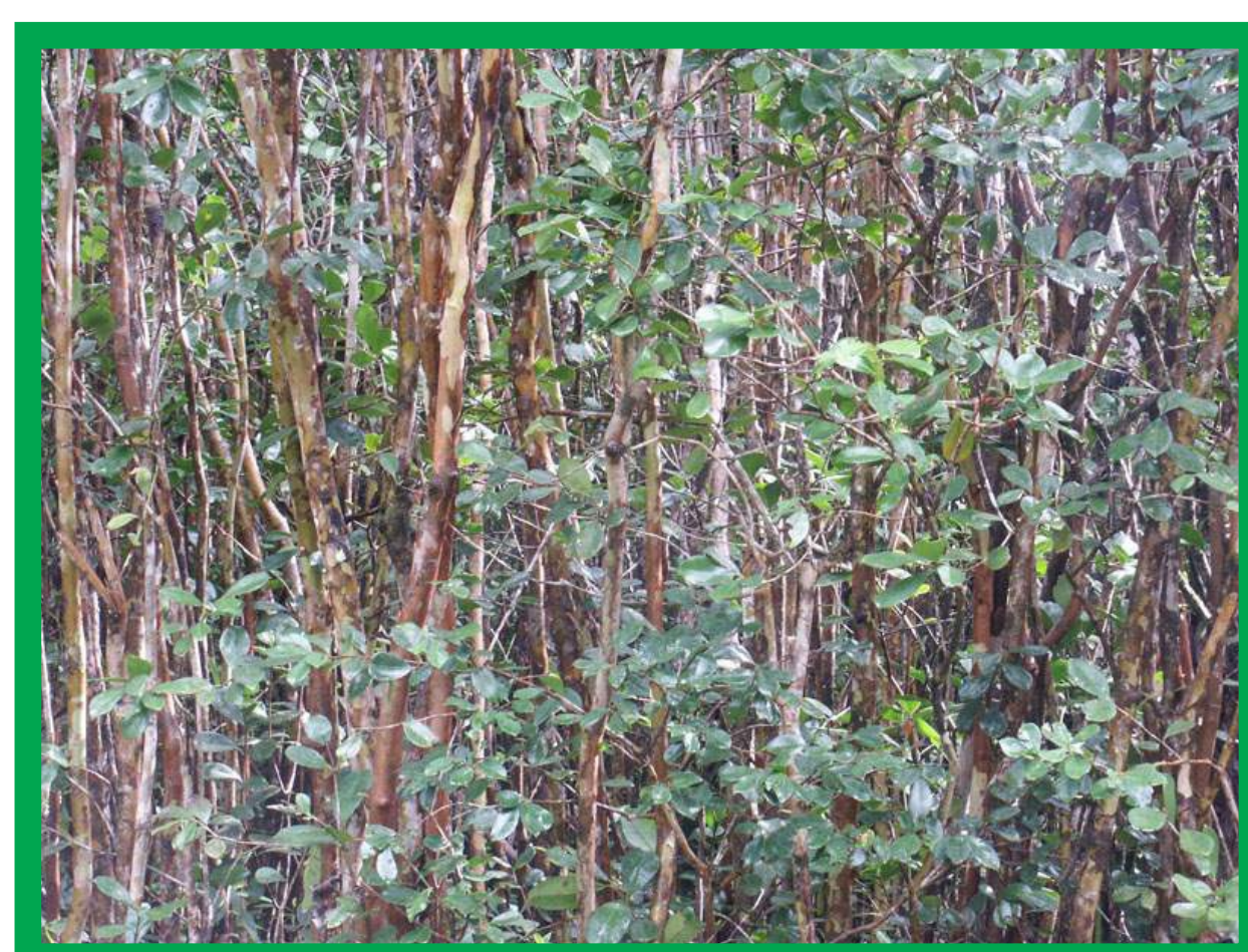
Typical dense stand of strawberry guava

Strawberry guava ( Psidium cattleianum ) is considered to be one of the most destructive invasive plant species in Hawai`i. This species was brought to Hawai`i in 1825 for its fruit and ornamental attributes. Due to a lack of natural predators and diseases in Hawai`i compared to its native Brazil, the plant has spread rapidly across the islands via both shoots and seeds, replacing many hundreds of thousands of acres of native forest with monotypic stands of the plant. For native forest replaced by strawberry guava, the rainfall lost to groundwater recharge due to this plant, is thought to be around 25 percent of total rainfall.