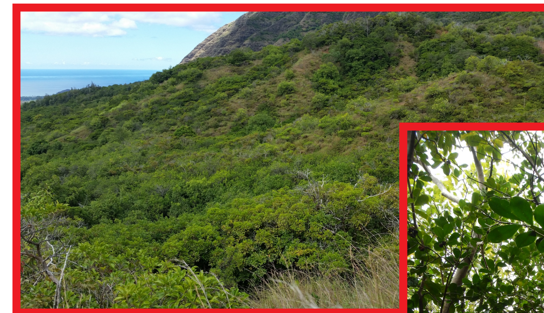
Test plot location, Mākaha Valley

Based on this successful introduction of T. ovatus across Hawai`i, and with the support of the State of Hawai`i Department of Land and Natural Resources (DLNR), BWS initiated a T. ovatus release in test plots on BWS watershed land. As strawberry guava has been overtaking much of the BWS watershed land in Mākaha, two 20 ft x 20 ft test plots were sited in this region, along a southwest-facing ridge in the back of the valley. The plots' exposure to wind was anticipated to aid in the spread of T. ovatus hatchlings over time.