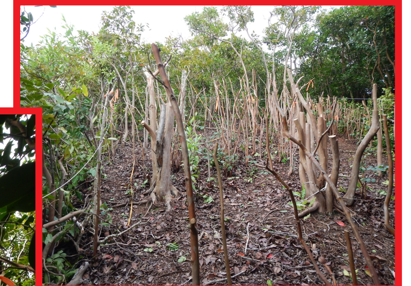
Strawberry guava on test plot, after "topping"

Drawing from methods used successfully in the previous T. ovatus releases in Hawai`i, the test plots were prepared by "topping" the existing strawberry guava, waiting until the new leaves began to "flush", then planting several young strawberry guava already inoculated with T. ovatus throughout the plots. The test plots were prepared in late 2017, and inoculated in early 2018.