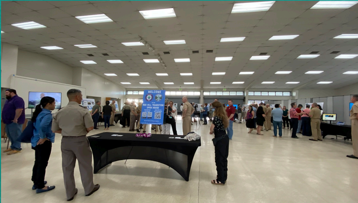
Joint Task Force –Red Hill and Navy Task Force Red Hill Open House 2/7/2024

Department of Defense Announced Closing Red Hill WILL NOT Impact Operational Readiness