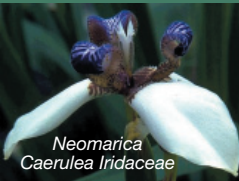
Neomarica Caerulea Iridaceae

Parking on Iwaena & 'Iwa'iwa Streets Free shuttles on Iwaena Street (please carpool)