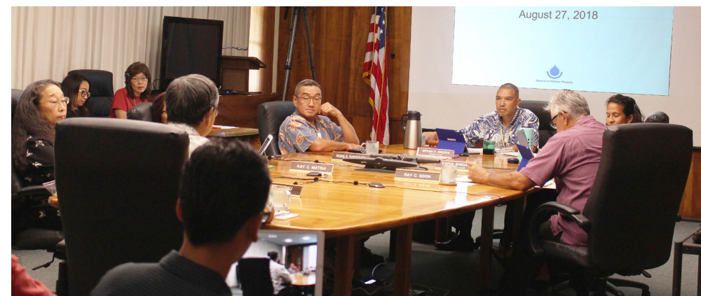
At its Aug. 27, 2018, monthly meeting, the Board of Water Supply (BWS) Board of Directors voted to adopt Resolution No. 889,2018.

At its August 2018 meeting, the Board of Water Supply's (BWS) Board of Directors adopted a new five-year water rate schedule. The schedule started in September 2018, but adjustments to the rates and tiers will not become effective until July 1, 2019. The new rates will allow the BWS to continue to provide safe, dependable, and affordable water to the one million people we serve on Oahu now and into the future.