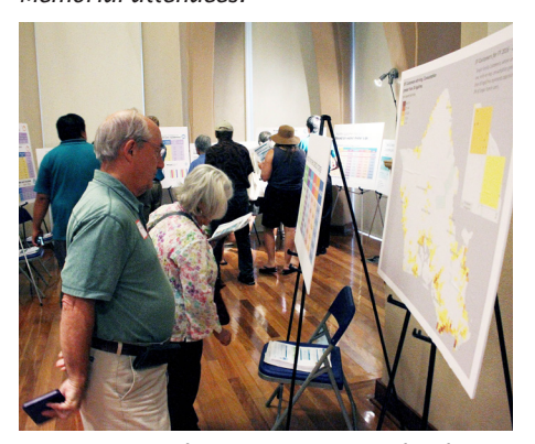
Hearing attendees review material to learn about the planned rate increases.