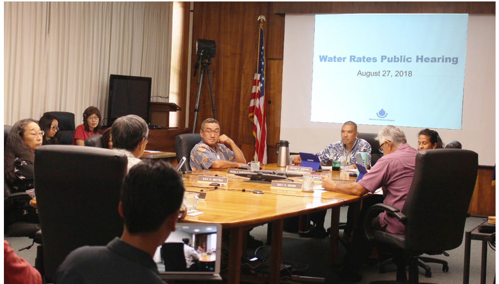
At its Aug. 27, 2018, monthly meeting, the Board of Water Supply Board of Directors voted to adopt Resolution No. 889, 2018.

The BWS conducted extensive outreach to make customers aware of the proposed rates, prior to their adoption by the Board. Efforts included informational presentations to 15 Neighborhood Boards and other interest groups, media interviews, and four public hearings throughout Oahu. Additionally, changes to the water